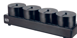
Selector for large socket