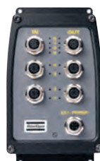
I/O expander sealed