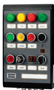
Operator panel Advanced