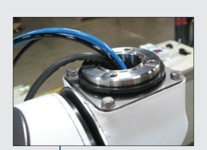
INTERNALLY ROUTED CABLES AND HOSES