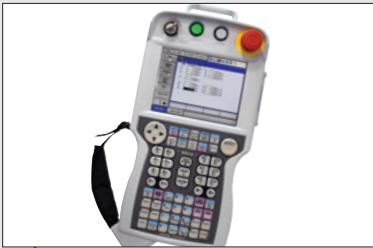
FAMILIAR PROGRAMMING INTERFACE