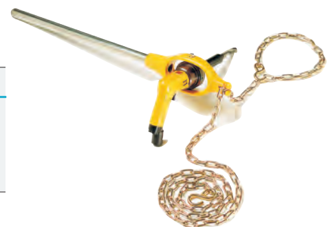
Power feed arm