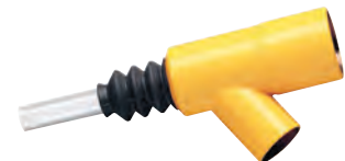
Spot suction attachment

Other standard sizes of front nozzle available.